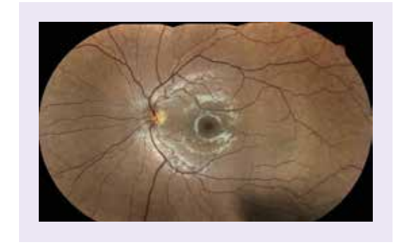
Mosaic of healthy retina

You sit in front of the EIDON, it captures two or more images of your retina, normally in one minute. The screening is comfortable and does not require dilating drops.